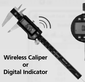
Wireless Caliper or Digital Indicator