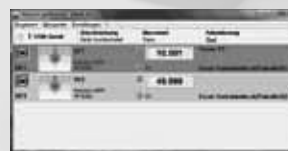
MarCom Professional 4.0