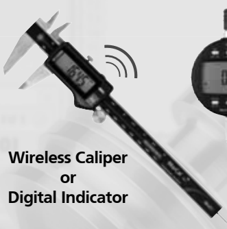
Wireless Caliper or Digital Indicator