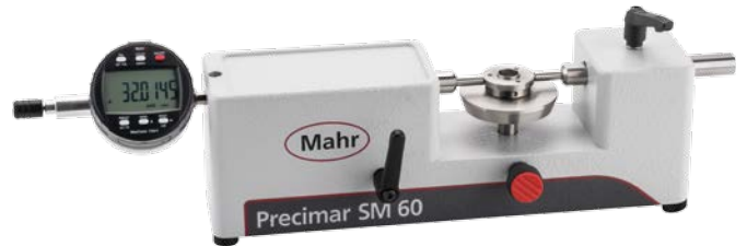
Shown with optional MarCator 1086