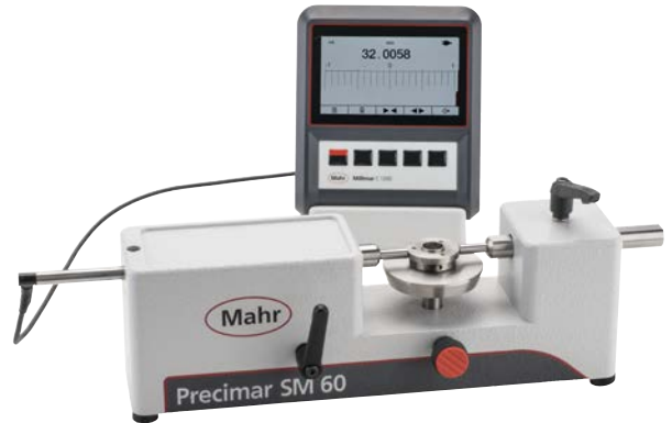
Shown with optional C 1200 and P 2004 M