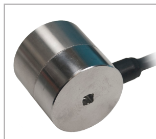
^ Female square drive