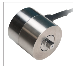
^ Male square drive