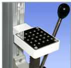
Mounting table kit TSA003

Converts to horizontal orientation, for alternative mounting arrangements.