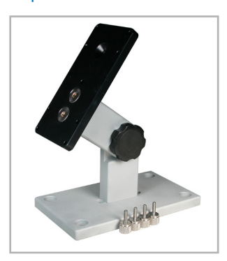
AC1008 Tabletop stand for indicator

Conveniently positions the indicator for easy viewing. Includes thumb screws to for indicator installation and thru holes for bench mounting.