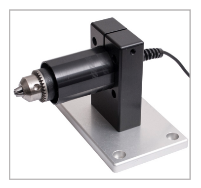
AC1007 Tabletop stand for sensor Secures the sensor in a horizontal orientation.

Conveniently positions the indicator for easy viewing. Includes thumb screws to for indicator installation and thru holes for bench mounting.