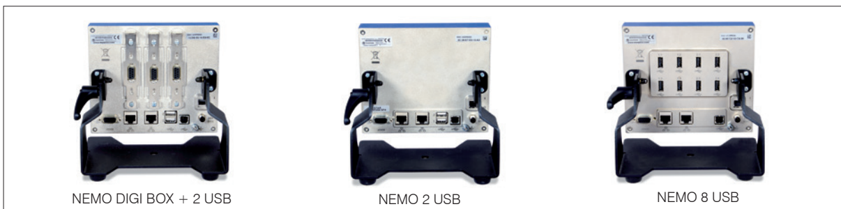
NEMO DIGI BOX + 2 USB

simple measurement applications intuitively and rapidly. Nemo is capable of acquiring data from traditional and wireless measurement devices and storing them locally or uploading them to a LAN network. The 5.7" colour display guarantees easy to read measurements, and the touch screen enables the operator to carry out programming operations and acquire data, without the need for external input devices. Thanks to its embedded architecture, the Nemo is smaller than a sheet of A5 paper, while the built in Secure Digital micro card provides powerful memory capacity. Nemo software guarantees a friendly and easy to use operator interface. Its touch-screen designed human interface allows to program and acquire measures without any additional input/command device.