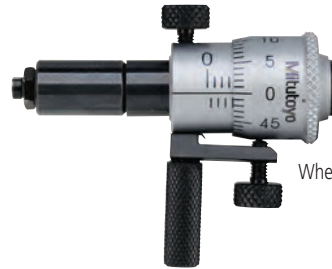
When using the extension rod