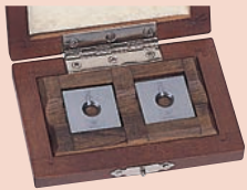
Carbide 2-block set