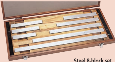
Steel 8-block set