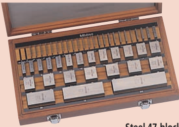
Steel 47-block set