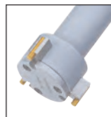
TiN coated contact points (*-10" suffix models only)