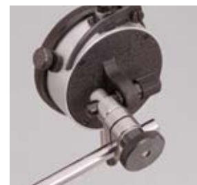
Left: 657AA with 711FS Last Word® Dial Test Indicator Above: 657AA with 196B1 Universal Dial Indicator Above Right: 657Y with lug-on-center back